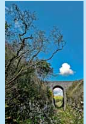
Top of Yeates Incline

joins up with the Yeates Incline. Volunteers have been opening footpaths and revealing original features such as stone water troughs for the horses and track surfaces. The Verne Citadel, now a prison dominates the landscape as well as the three bridges in a row which mark the Yeates Incline.