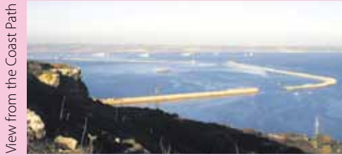
View from the Coast Path

This footpath takes you down a steep, uneven descent to join the disused railway line below. This unique landscape altered by landslips and quarrying is rich in archaeology and wildlife. Keep a look out for the herd of feral British Primitive goats which have been reintroduced to help