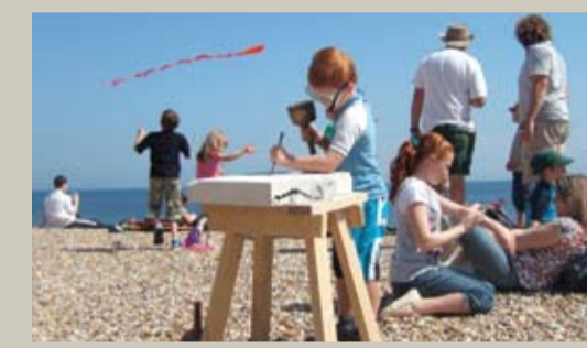
MEMO at the Lyme Regis Fossil Festival

Three and half centuries of science have taught us that we are not the endpoint of evolution, yet we have inadvertently come to redefine it with the pressures of our modern economic systems. We have embarked upon the greatest extinction since the dinosaurs – by speed if not yet by sheer scale. But the magnitude has yet to be recognised by the opinions and actions of a global population whose fates are dependent on the survival of the biodiversity it now threatens.