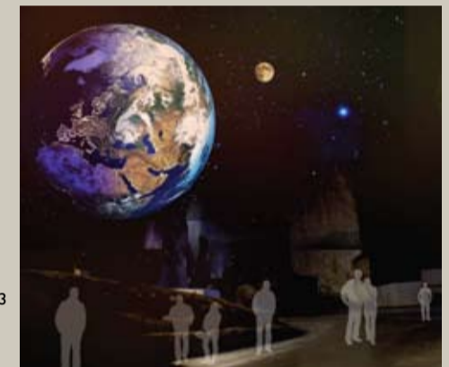
Cavern of the Earth and Stars | Vision 3

The view back to the mainland from the site is an epic panorama across 185 million continuous years of the history of life. It is hard to imagine a more profound location to consider the future of life and to catalyse a renaissance of wonder and respect for the natural world.